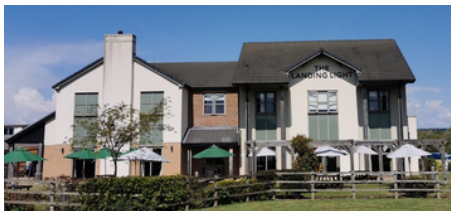
Local pub, The landing Light will be used as the Inn for Mary and Joseph

In Haywood Village, Weston Super Mare they will be exploring that idea. Instead of a traditional nativity play, the church's youth group will take centre stage as television reporters, anchors and eyewitnesses to the first Christmas. The young people will "go live" from Bethlehem, interviewing Mary and Joseph, shepherds, angels, and