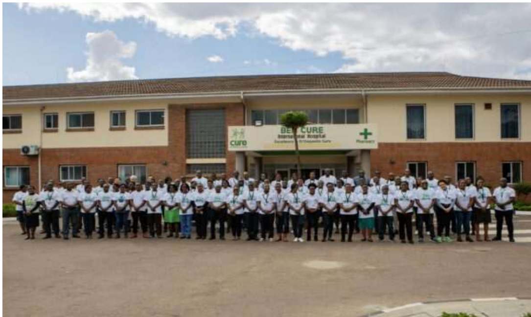
The Beit-CURE Children's Hospital of Malawi

No child should suffer needlessly from a treatable condition simply because they were born into poverty or in a country with limited medical resources.